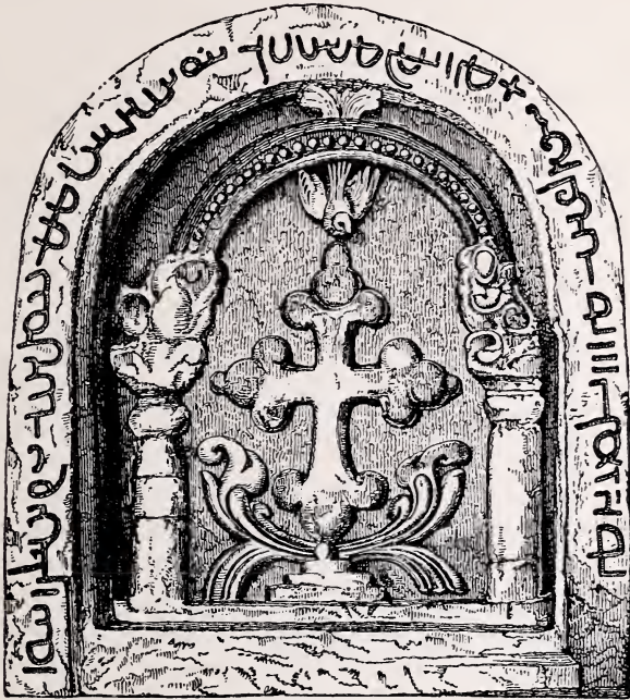
THE CROSS ON THE TOMB OF ST. THOMAS NEAR MADRAS. 3

These Syrian Christians shared the fervor and missionary zeal of their founder Nestorius. They distinguished themselves through